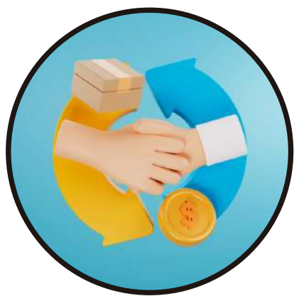
Project Material Solutions