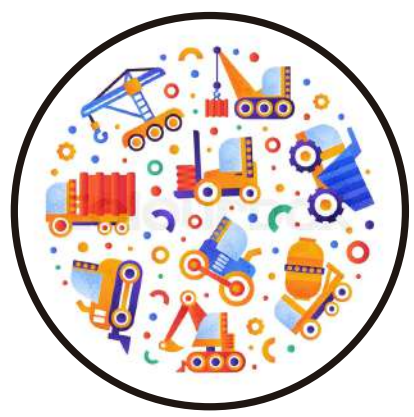
Equipment, Machinery and Vehicle Rental Services