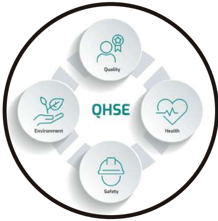
QHSE Management Solutions