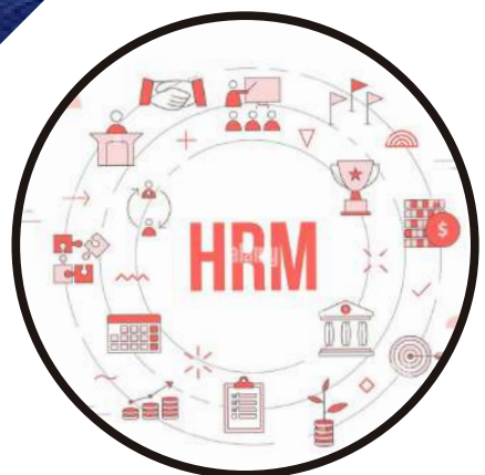
HR Management Services